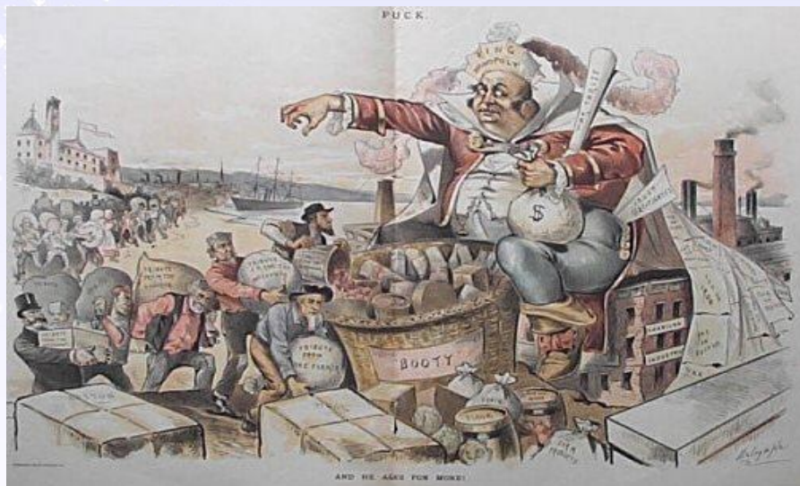
1886 Monopoly Cartoon. Color lithograph published in an 1886 issue of Puck shows King Monopoly exacting tributes from farmers, workers and merchants.

Social Darwinism is represented here, or survival of the strongest. The monopolies are able to survive and become strong because of the unfair practices allowed.